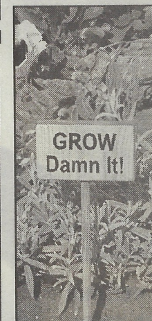
Ed Carlson makes very few demands in his garden. But one is to grow, if you're going to take up space.